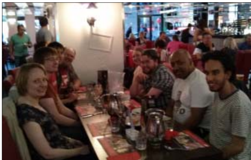
Ĉiuj partoprenantoj sidas ĉe table en la restoracio en Kardifo