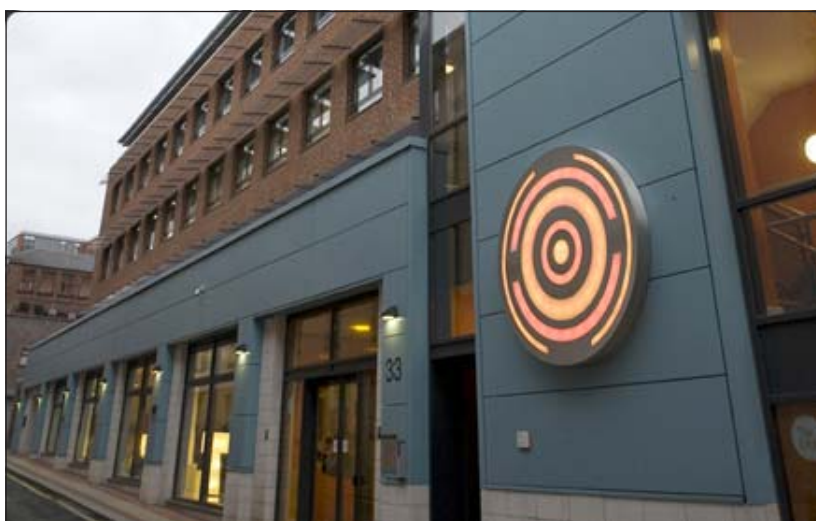
Exterior and interior views of The Circle conference centre in Sheffield, where next year's British Congress will take place, and, above, the specially designed Congress logo