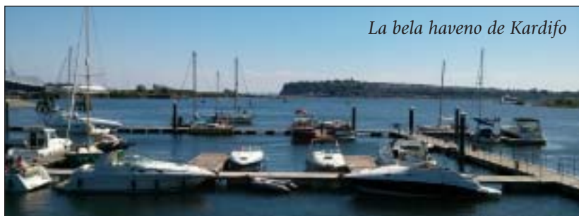
La bela haveno de Kardifo