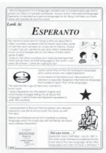
The cover of the new Look at Esperanto guide in Bessacarr's information series for children

The firm Bessacarr specialises in information booklets for children, and the latest publication from their series is called Look at Esperanto . It is an eight-page, two-colour glossy guide which gives a